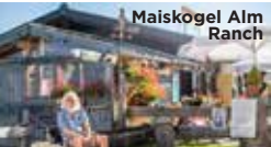
Maiskogel Alm Ranch